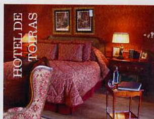
HOTEL DE TOIRAS

'The WHOLE of the island is spread below you; the other side endless SILVER OCEAN'