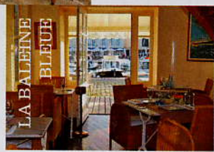
LA BALEINE BLEUE