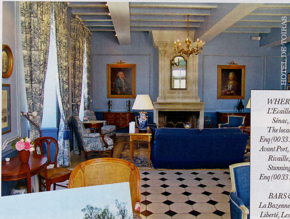
HOTEL DE TOIRAS

WHERE TO EAT L'Ecailler, 3 Quai de Sénac, La Flotte. The locals' favourite. Enq (0033 5) 46 09 56 40. Avant Port, 8 Quai Daniel Rivaille, St Martin. Stunning port views. Enq (0033 5) 46 68 06 68